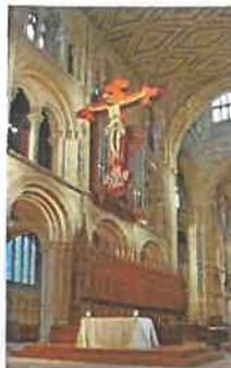
New platform and frontal for Nave Altar