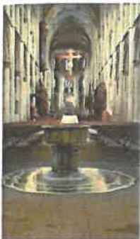
Making the floor and installing a mosaic surround