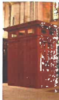
New vestibule for the south transept entrance

Over the past thirty years many projects have been funded by the friends.